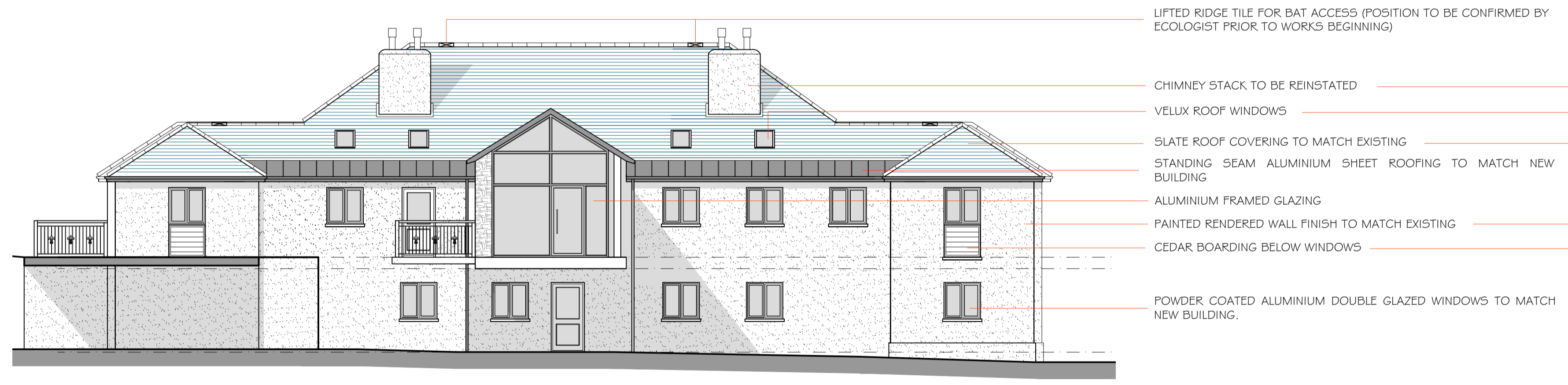
EAST ELEVATION AS PROPOSED (SCALE 1:100 @ A1)