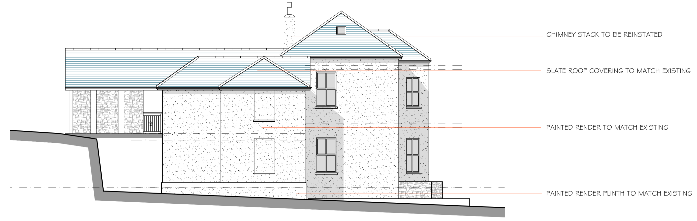
NORTH ELEVATION AS PROPOSED (SCALE 1:100 @ A1)