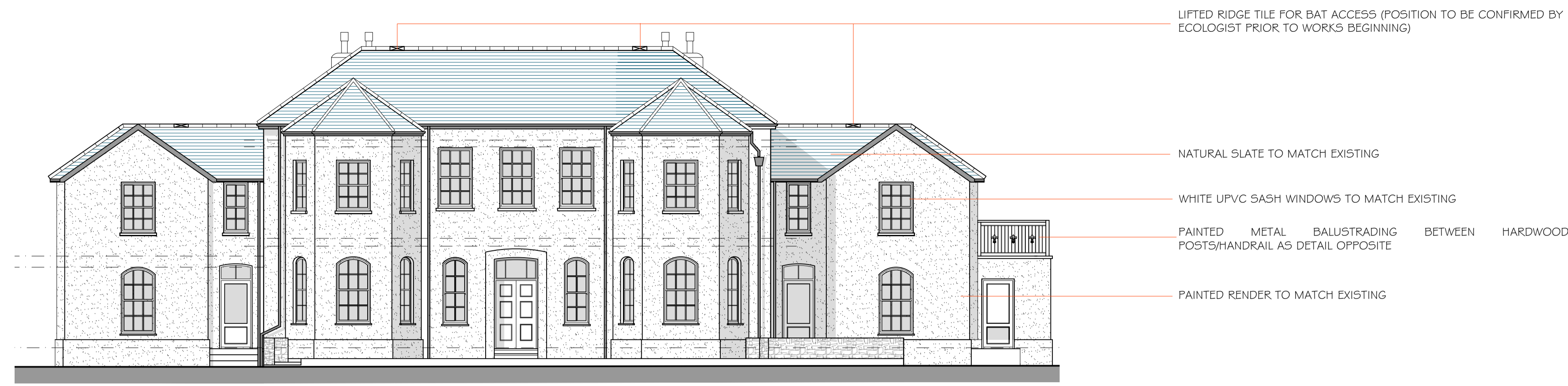
WEST ELEVATION AS PROPOSED (SCALE 1:100 @ A1)

THIS DRAWING MUST NOT BE SCALED, FIGURED DIMENSIONS, LEVELS ETC. ONLY ARE TO BE USED. ANY INACCURACIES ETC. MUST BE NOTIFIED TO THE ARCHITECT. DETAIL DRAWINGS AND LARGER SCALE DRAWINGS TAKE PRECEDENCE OVER SMALLER SCALE DRAWINGS. ALL SURVEY DRAWINGS ARE A RECORD ONLY. A REPORT ON THE STRUCTURAL INTEGRITY OF THE PROPERTY SHALL NOT BE DEEMED TO HAVE BEEN INCLUDED IN SUCH SURVEYS. THIS DRAWING IS COPYRIGHT.