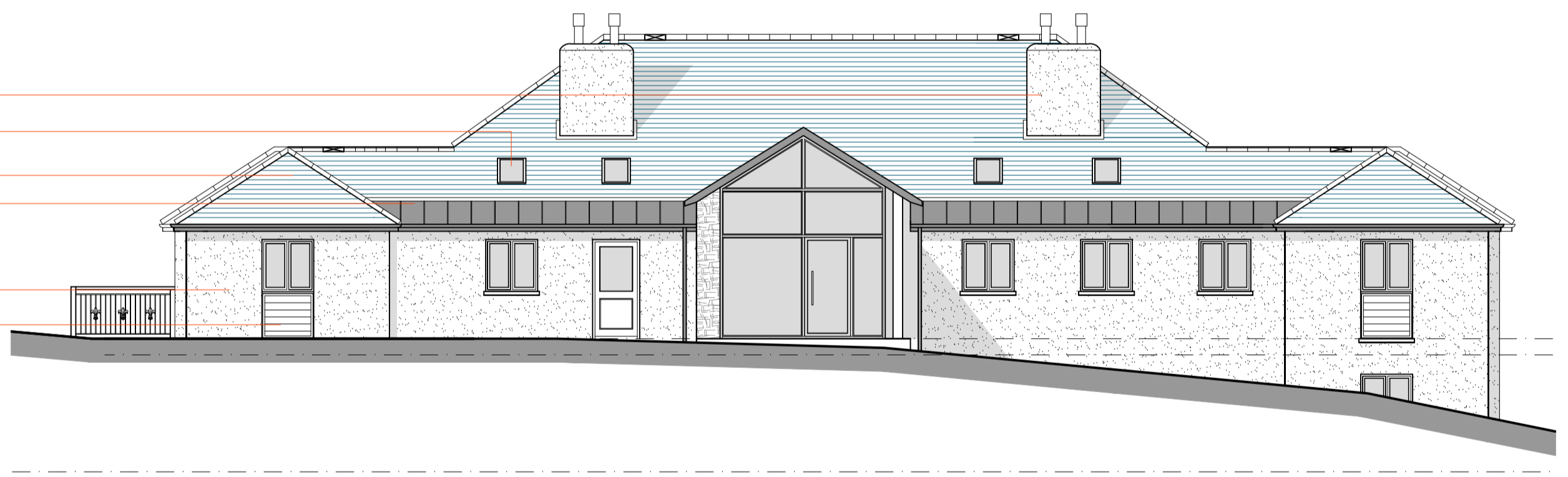
EAST ELEVATION AS PROPOSED (SCALE 1:100 @ A1) ELEVATION SHOWING EXTERNAL GROUND LEVELS FROM SETTING DOWN ZONE