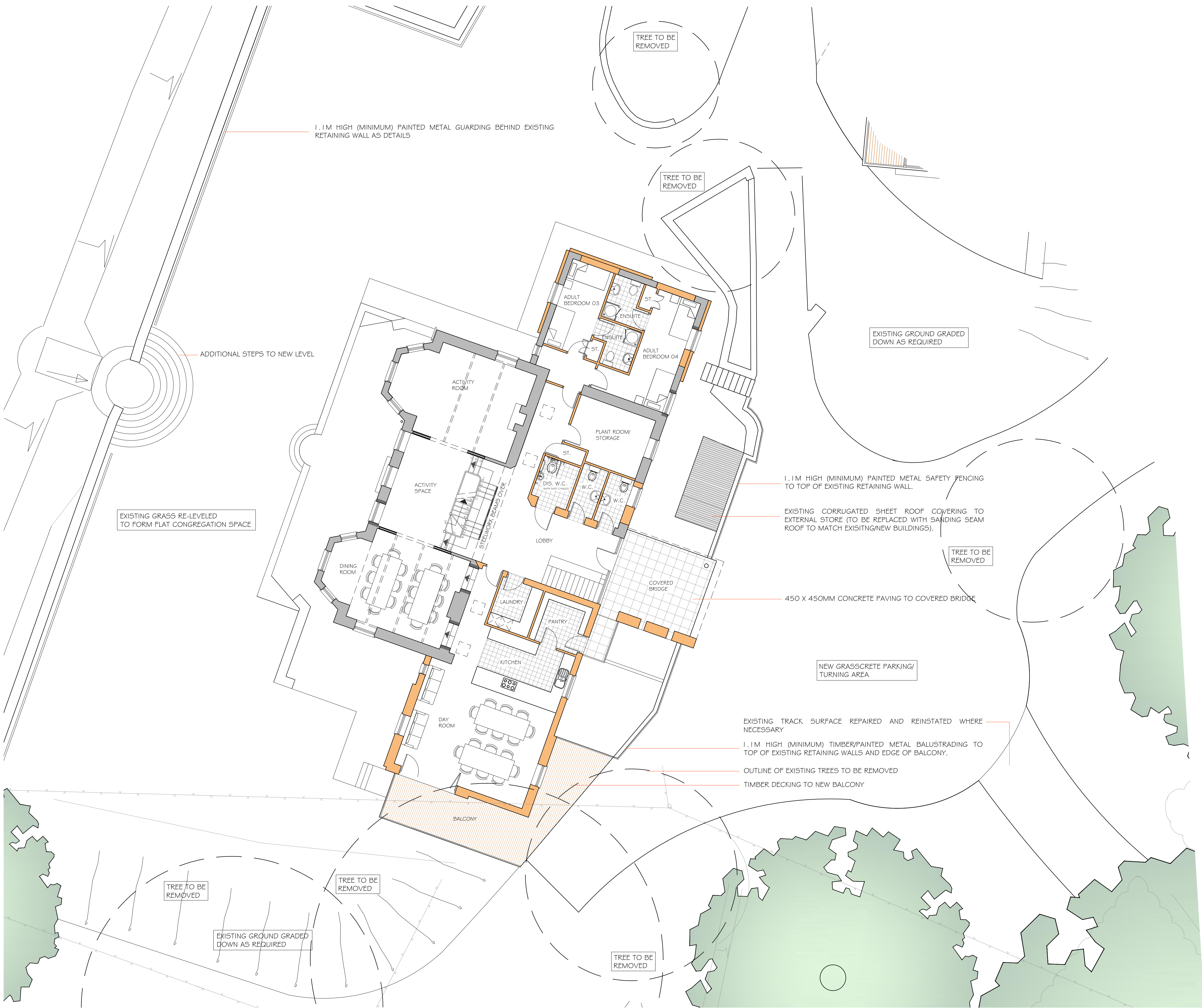
GROUND FLOOR PLAN AS PROPOSED EXISTING BUILDING SCALE (1:100 @ A1)